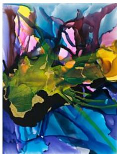
4. last one out 2010 synthetic polymer paint, ink & vinyl on linen 240.0 x 183.0 cm $14,000