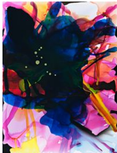
1. every part of me's floating 2010 synthetic polymer paint & ink on linen 240.0 x 183.0 cm $14,000

Lara Merrett, every breath you take 2 – 26 June 2010