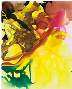
2. side by side 2010 synthetic polymer paint & ink on linen 230.0 x 185.0 cm $14,000