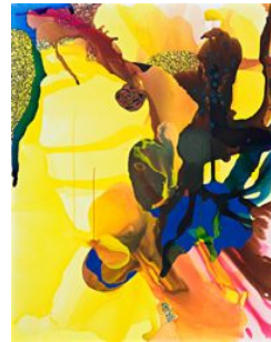
5. in your face 2010 synthetic polymer paint & ink on linen 230.0 x 185.0 cm $14,000